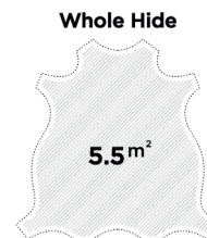
Diagram below illustrates the largest approximate panel size that can be cut from this hide.

Information is based on average hide sizes and should be used as an approximate guide only. Hide shapes and sizes vary.