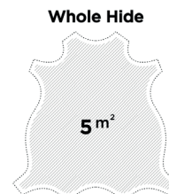
Diagram below illustrates the largest approximate panel size that can be cut from this hide.

Information is based on average hide sizes and should be used as an approximate guide only. Hide shapes and sizes vary.