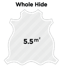
Diagram below illustrates the largest approximate panel size that can be cut from this hide.

Information is based on average hide sizes and should be used as an approximate guide only. Hide shapes and sizes vary.